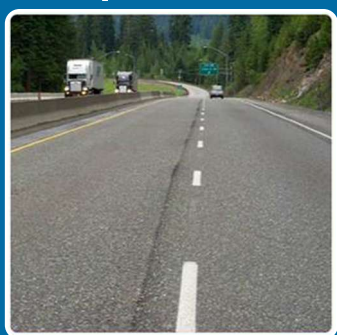
WINTER REPAIR Seam separation on the asphalt surface cannot be repaired with a cold mix.