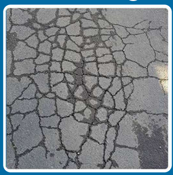
WINTER REPAIR Alligator cracking on the asphalt surface cannot be repaired with a cold mix.